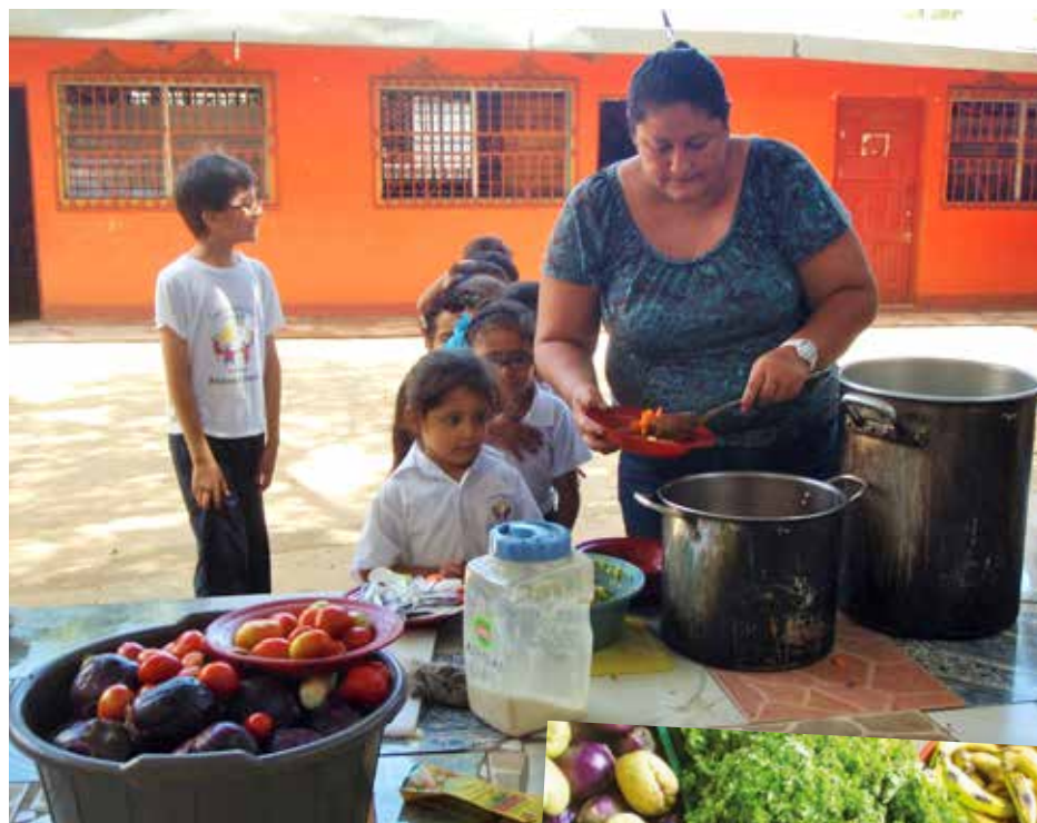
Lunch at the Ananda Marga school, Villa Reconciliacion, Managua

● In Villa Reconciliacion Eat United works with the Ananda Marga Education Centre