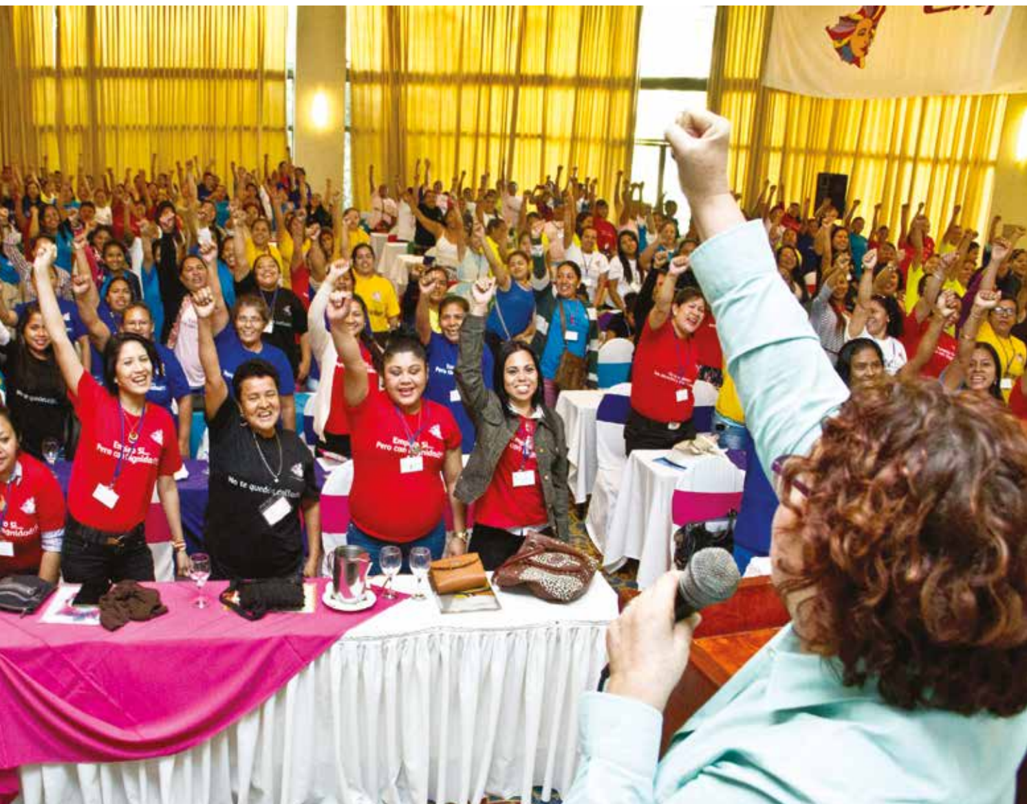
MEC's 18th National Convention, March 2016 where 600 members debated the advances and deficiencies of workers' rights, equal opportunities, occupational health and job security, and their implications for women workers and human rights in Nicaragua.

of their rights. We are fighting for the right to dignified employment, the right to access credit and own land, the right to participate in decision making. Our volunteer promoters are women with a political commitment to fight for the rights of other women. We see empowerment in this way, first as an individual commitment but it also has to be collective."